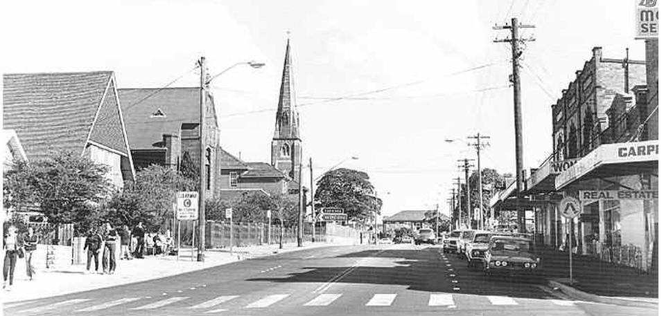
'Main Street Nareburn 1978' Left: the Anglican Memorial Hall, demolished in 1983, St Cuthbert's Anglican Church, St Leonard's Catholic School and Church. Note the pedestrian crossing at the corner of Rohan, with the bus stop further north.

Nareburn has witnessed many changes in the church communities that have been part of its district; Congregational Church (1884–1973), Church of Christ (1925–1985), Church of England/Anglican (1883 - ), Catholic Church (1894 - ) The last two remain, have historic district links, and face exciting and challenging changes.