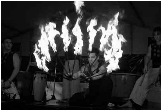
Right & Above: Rhythm Hunters drum in Earth Hour with mesmerising hoop and fire dance performers.

When asked if he thought that Earth Hour was an effective strategy to create environmental awareness and global sustainability he replied, 'Yes, I think community events which bring everybody together is a great way to create awareness and enforce the message of the importance of the environment.' In response to my question about the environmentally friendly strategies that he implements at home or at work he said 'At my business I follow the sustainable business program implemented by Willoughby City Council, it involves me using energy conserving lights.'