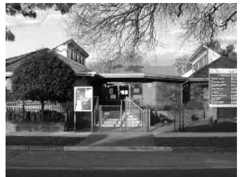
Naremburn Community Centre, a vision of NPA-sponsored NADA that was set up to fund-raise.