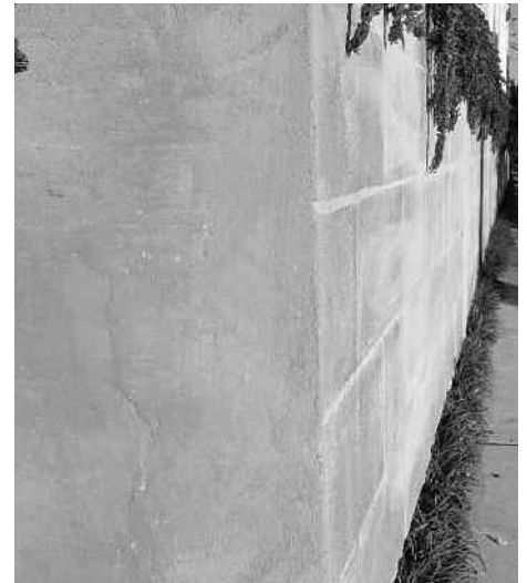
Besser Block retaining wall un-bagged on the right hand side, bagged on the left just needs to be painted.