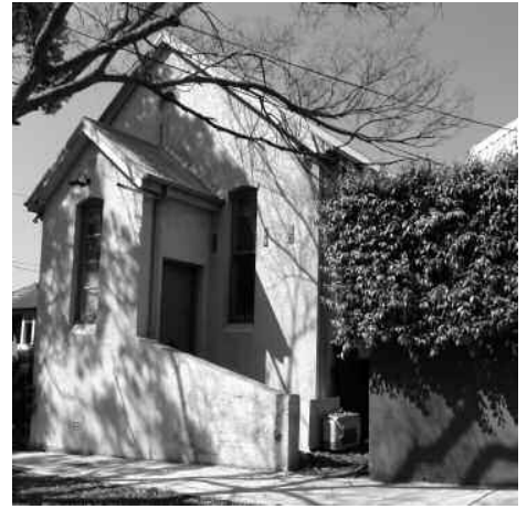
31 Central Street, formerly The Temperance Hall, where NPA foundation meeting held 27 November 1901.

We thank our public-minded Naremburn residents who founded the NPA, the first progress association in the Willoughby Council area, on 27 November 1901.