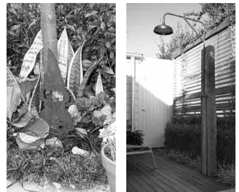
Spot the gnome! The shower is made from an old railway sleeper and left-over copper pipe.