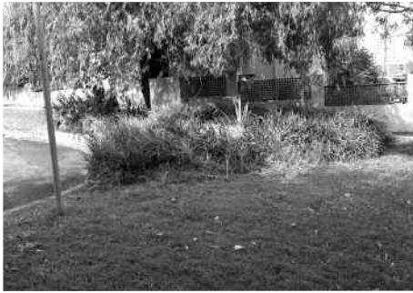
Before (above) and after (below) a morning's work in the new Community Garden.