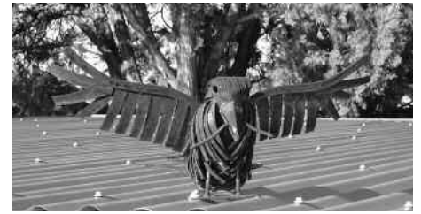
A rusty iron kookaburra rules the shed roof whilst a silver frog reclines by the pond.

If you take a look in my garden I have many pieces scattered about. They are all different sizes. They don't have to be huge statuesque things, some on walls, edges of paving or decking, next to the ponds, edges of gardens, some of mine are usable – they are pieces I have bought or made. They can be new or old – some of my pieces are bits I found while renovating. They live on in the garden – talking points, little quirky things – it's me – it's personal!