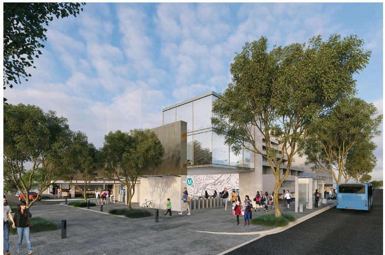
Artists impression of the Sydney Metro station at Crows Nest