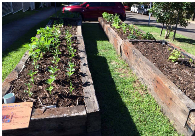
The new garden beds