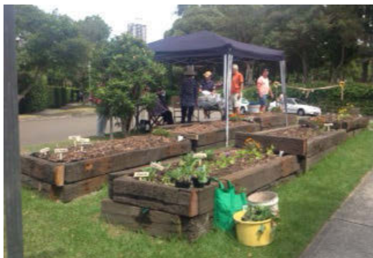
Station St opening day